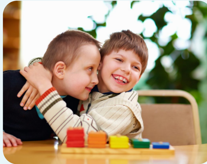
Coverage of rehabilitation costs for children with disabilities