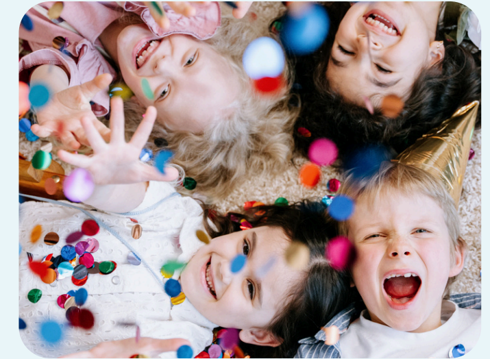
Projects and social initiatives for children with disabilities