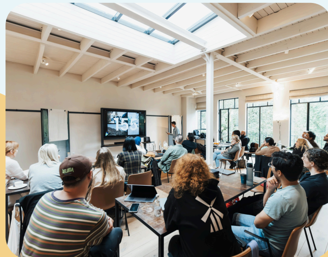
Educational and awareness-raising programs