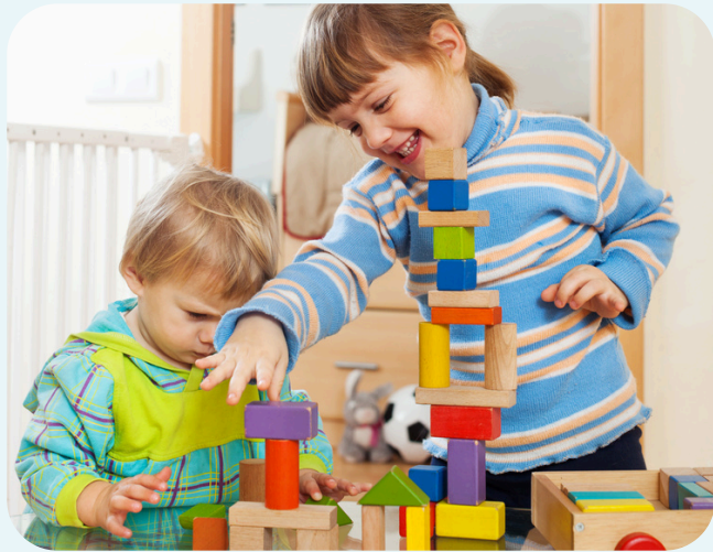
Social services: Day care, social adaptation, and counseling